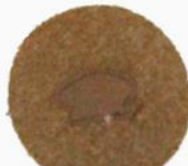
O-34, $5 cook