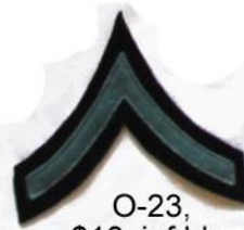
O-23, $10, inf blue