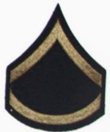
O-42, $10, 1930s PFC specialist