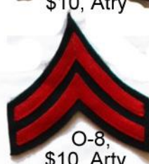
O-8, $10, Arty