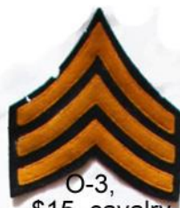
O-3, $15, cavalry