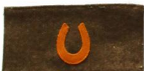
O-15, $15. Cav farrier