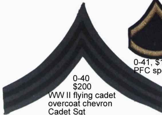
O-40 $200 WW II flying cadet overcoat chevron Cadet Sgt