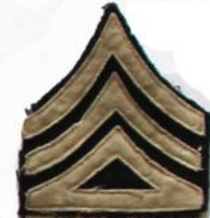
O-13, $10. Inf company Supply Sgt