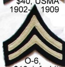
O-6, $10, inf white