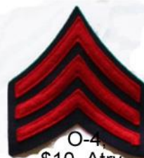
O-4, $10, Atry