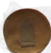
O-21, $10 2d Cl Guner