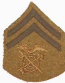
O-29, $14 hand emb QM design