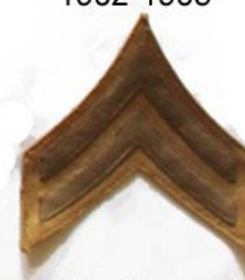
O-25, $5. wool on cotton