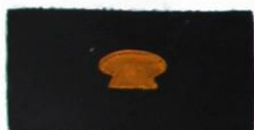
O-10, $15, Cav cook