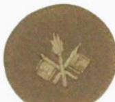
O-33, $10 hand emb flags