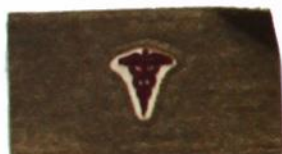
O-14, $5. Medic PFC