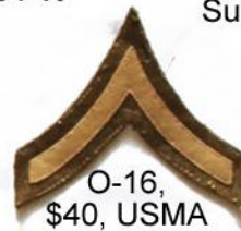
O-16, $40, USMA 1902-1905