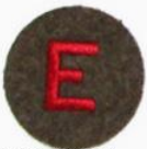
E-38, $10 machine emb on wool