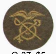
O-37, $5 embroidered on wool