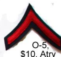
O-5, $10, Atry