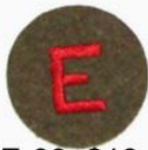
E-39, $10 mand emb on wool