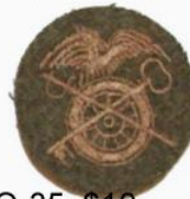
O-35, $10 large detailed device on wool