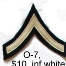
O-7, $10, inf white