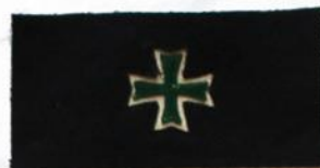
O-12, $5, Medic Pvt 1901-1902