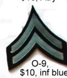
O-9, $10, inf blue