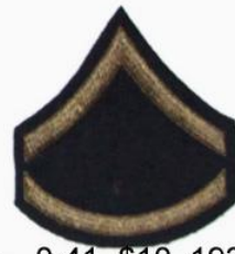
O-41, $10, 1930s PFC specialist