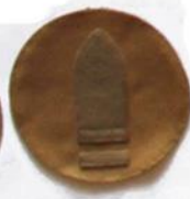
O-22, $10 1st Cl Guner