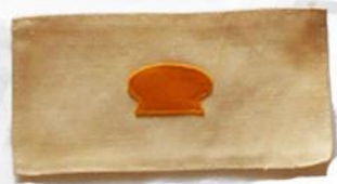
O-18, $15, Cav cook