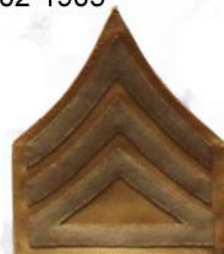
O-24, $5. wool on cotton