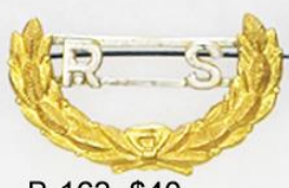
B-162. $40 collar