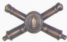
B-96, 10 sew-on loops