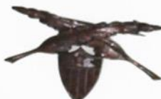
S-82, $10 WWI