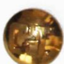
S-92, $7 dome