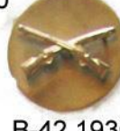
B-42 1930s screwpost