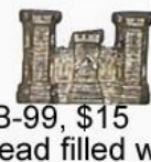
B-99, $15 lead filled w two fastening wires