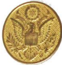
B-6, $3, 1930s