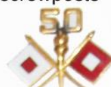
S-65, $8 50 above