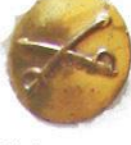
B-34 struck as 1 piece screwpost $10