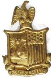
B-7, $25. 2 wire loops on back