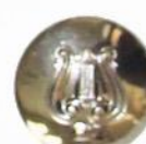
S-95, $4 dome band silver