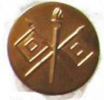
B-50, 1 piece