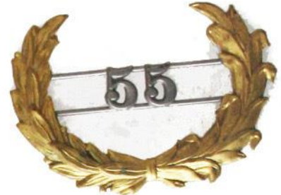
B-8, $25. 2 wires on back, one wire missing

Before insignia, buttons distinguished units. Below are early U.S. Army buttons. Hard to find at these prices.