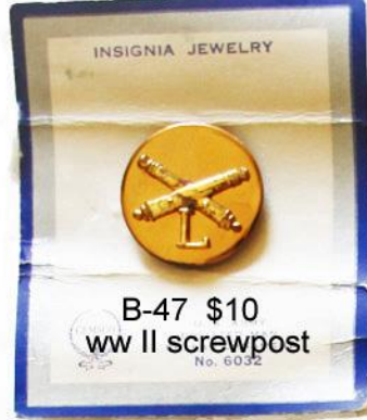
B-47 $10 ww II screwpost