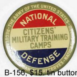
B-156, $15 tin button w/ horizontal pin