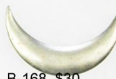
B-168. $30 pre1890s commissary sgt fpr cap.