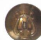
S-96, $4 dome Band