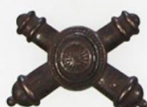
B-166, $50 pin-back