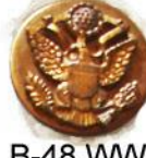
B-48 WWII screwpost