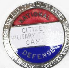
B-157, $15 chrome w/ vertical pin