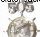
S-67, $5 505 above