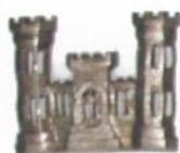
S-62, $25 pinback