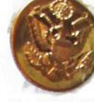
B-49 WWII screwpost