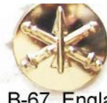
B-67, England made plastic