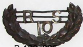
B-160. $25 collar