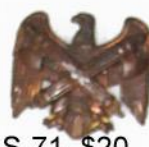
S-71, $20 pinback