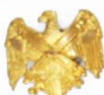
S-70, $20 screwpost