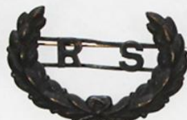
B-161. $25 collar