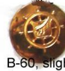
B-60, slight dome