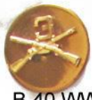
B-40 WWII screwpost