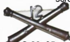
S-83, $5 WWI