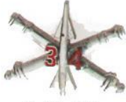
B-26, $5 silver color