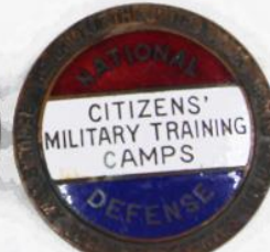
B-158, $15 brass w/ vertical pin