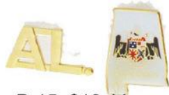
B-15, $10. Very recent state guard