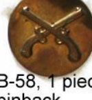
B-58, 1 piece pinback