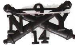
B-13, $ 5