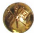
S-91, $3 dome