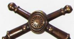
B-165, $50 sew-on loops