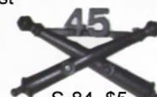
S-84, $5 WWI