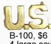
B-100, $6 4 large sew -on loops