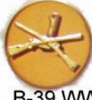
B-39 WWII screwpost