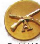
B-44 WWII screwpost