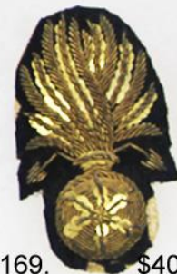
B-169. $40 pre Civil war coat tail.