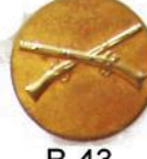
B-43, 1 piece