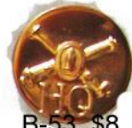
B-53, $8 WWII screwpost