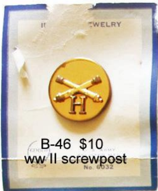
B-46 $10 ww II screwpost