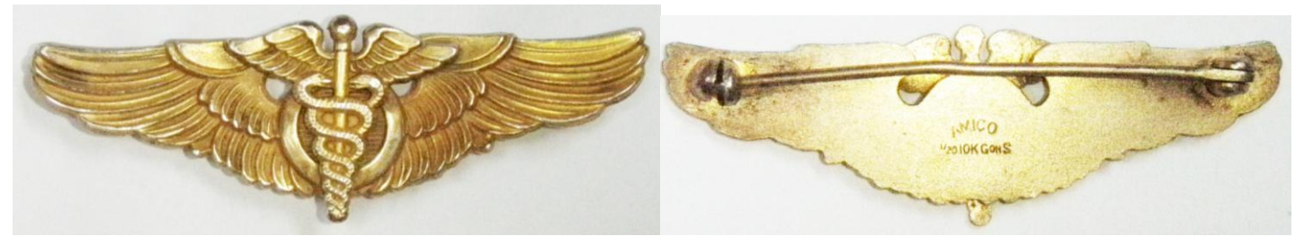
Gold Flight Surgeon marked AMICO, 2 inches wide. Authorized 1942-44.