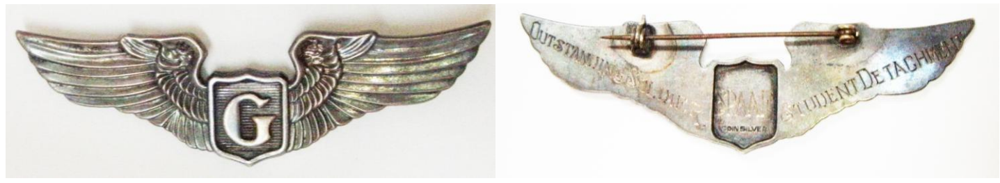
Glider pilot, 3-1/4 inch wide, marked COIN SILVER and engraved "Outstanding Student SPAAF Student Detachment." Authorized for officers and for E.M., starting in 1942.