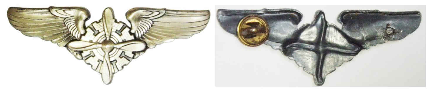
Flight Engineer, authorized in 1944. Unmarked; one tine is broken off.