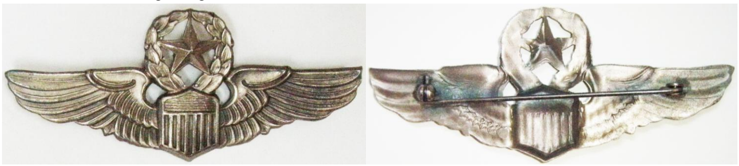
Command pilot, first authorized in 1941. 3 inches wide, made in Germany circa 1946-47.