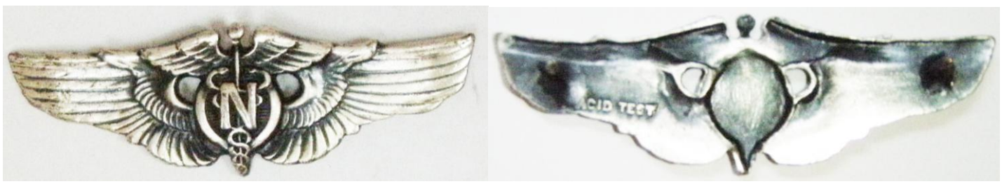
Flight nurse, 1944, 2 inches wide, marked ACID TEST.