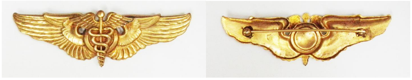
Gold Flight Surgeon Meyer marked, 3-3/16 inches wide. Authorized 1942-44.