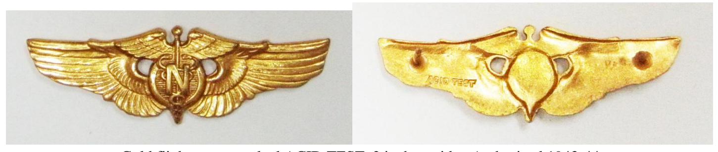
Gold flight nurse marked ACID TEST, 2 inches wide. Authorized 1943-44.