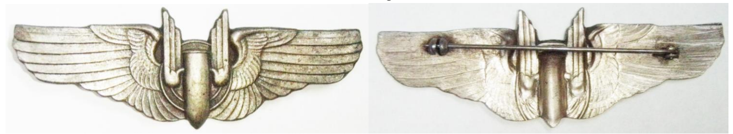
Aerial Gunner, 2.95 inches wide, made in Germany, made circa 1946-47.