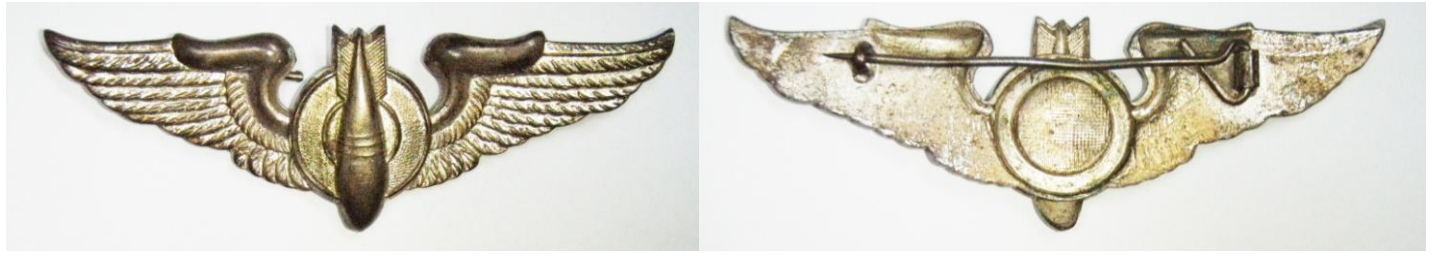
British made bombardier, 3.05 inches wide. Authorized in 1942.