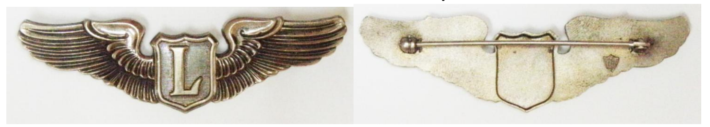
Liaison pilot, 3 inches wide, marked with N S Meyer shield.