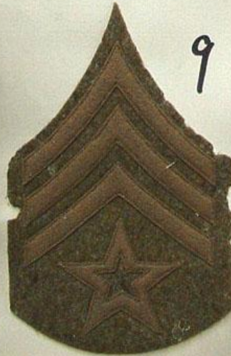
9 COLOR SERGEANT.