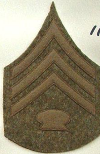
11 MESS SERGEANT.