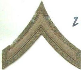
19 BAND CORPORAL.