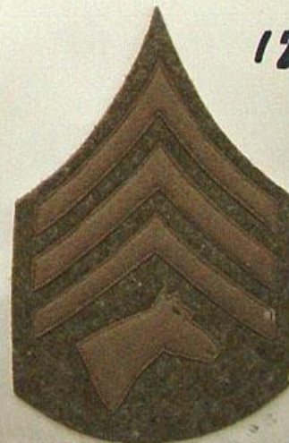
12 STABLE SERGEANT.