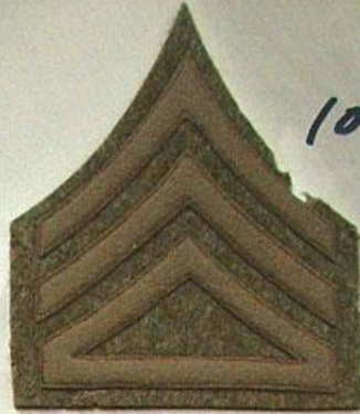
10 SUPPLY SERGEANT.