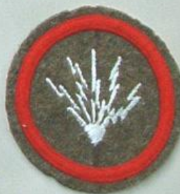
41 MASTER GUNNER C.A.C.