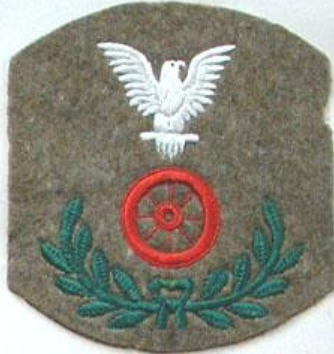
-63 MASTER ENGINEER SENIOR GRADE TRANSPORTATION CORPS.