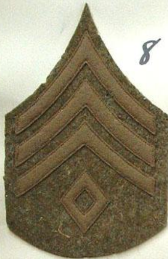
8 FIRST SERGEANT.