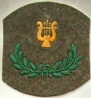
7 ASSISTANT BAND LEADER.