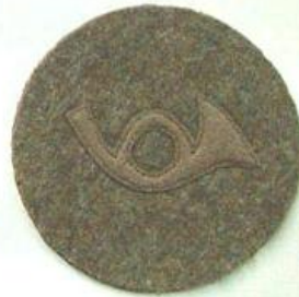
25 BUGLER FIRST CLASS.