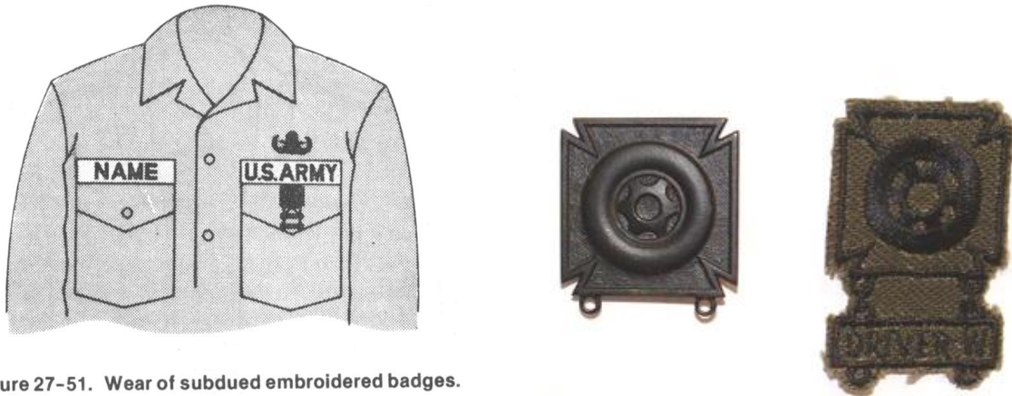
Figure 27-51. Wear of subdued embroidered badges.

worn on the left pocket flap or similar location on uniforms without pockets. Two pages later when discussing subdued embroidered badges there is a statement the driver/mechanic badge will not be worn on the utility uniforms, but then immediately after this shows a subdued driver badge on a utility uniform. The army never intended for a subdued badge to be worn, but given that it appeared to be authorized, makers produced them and some soldier wore the badges.