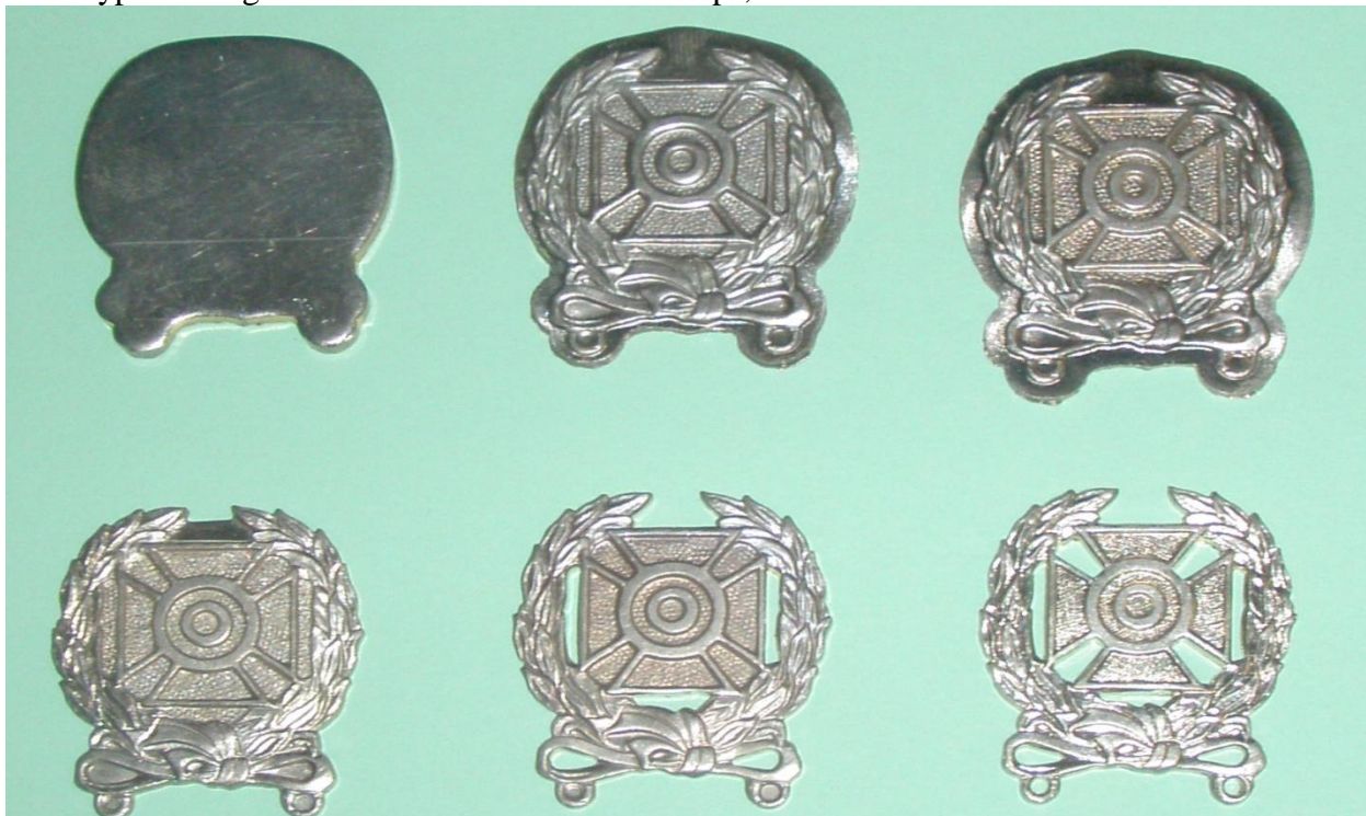
Top Row—Step 1: A blank is made. Step 2: The first striking. Step 3: The second strike, which includes creating the maker's mark on the reverse. Bottom Row—Step 4: Trim. Step 5: 1st piercing. Step 6: 2d piercing. All that is left is to add the pin on the reverse, the 7th step.

A typical badge was manufactured in seven steps, as shown and described below.