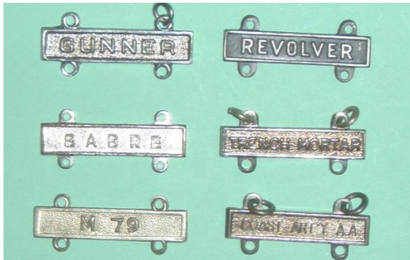
A few samples of the many unauthorized bars that have been made are at the left. Some are somewhat similar to prescribed bars.

A typical badge was manufactured in seven steps, as shown and described below.